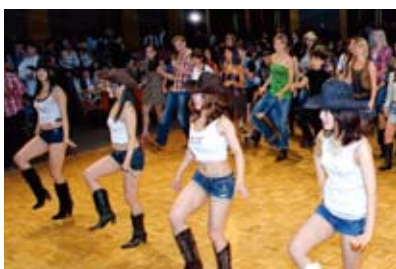
Cowgirls led the after-dinner dancing.