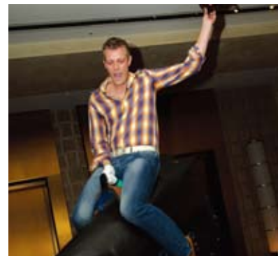
Mechanical bull was very popular.

At the Tyler Foundation's Rhinestone Cowboy fundraising gala dinner on 1 October, the star of the glittering show was not among the many generous bidders for the donated auction items, nor one of the petite cowgirls in revealing denim shorts. It was not even the mechanical bull and its brave riders—it was a cool and calm four-legged VIP, who won over the 369 guests as he casually sauntered on stage oblivious to the bright lights, flashing cameras and rapturous applause.